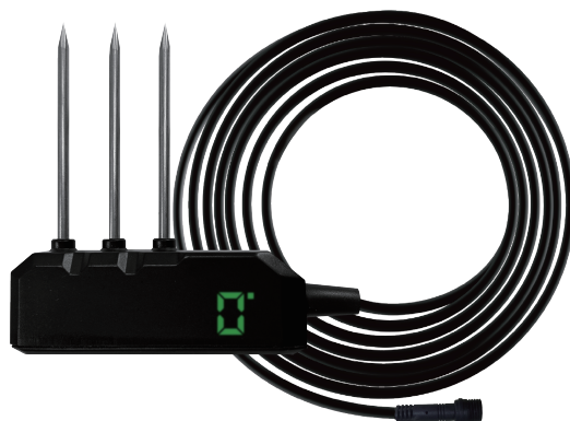
WCS-3 for Aqua-X Control System